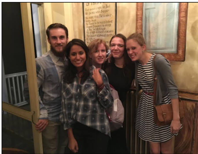
Outing to the historic Jean Bonnet Tavern

We survived our technology fast the first month of the semester! Actually, it wasn't at all like a restriction but more of an invitation to set aside social media and all the bombarding influences of the culture around us. It was worthwhile, and we believe this contributed greatly to the bonding and camaraderie we see in this group.